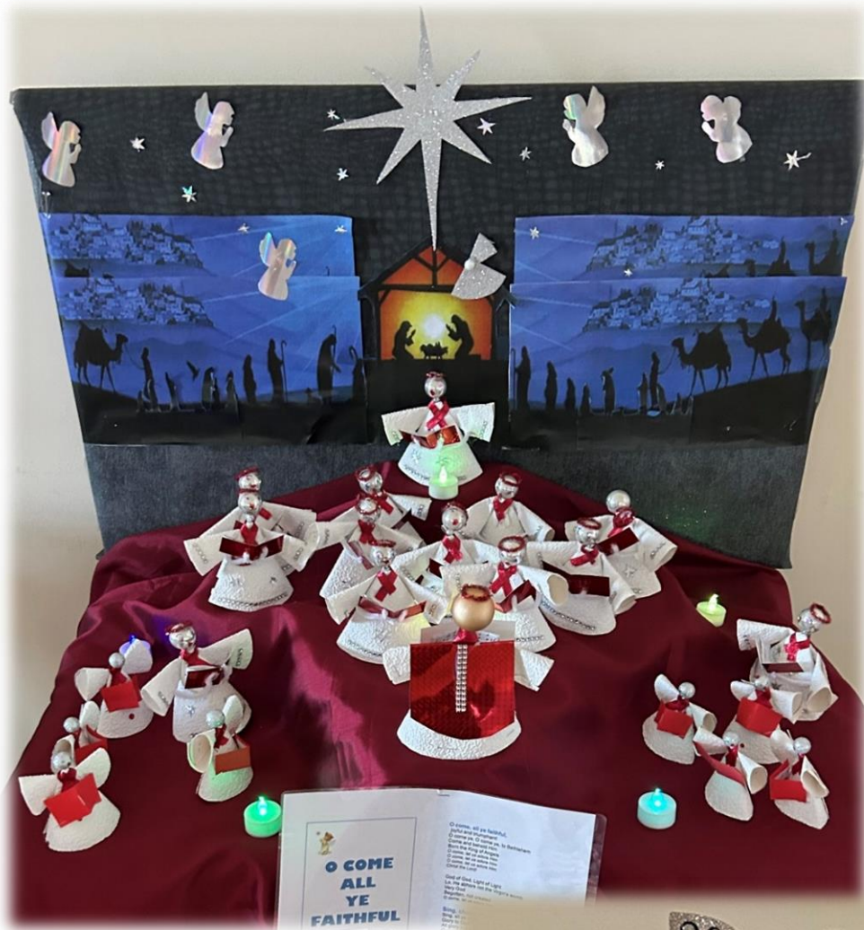
Left O Come all ye Faithful