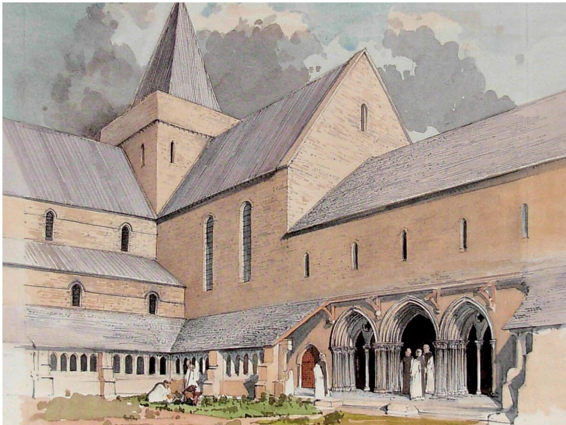
Artist impression 15 th century